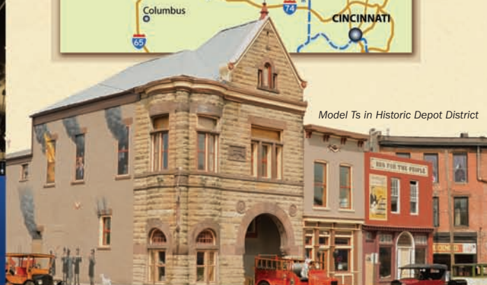
Model Ts in Historic Depot District