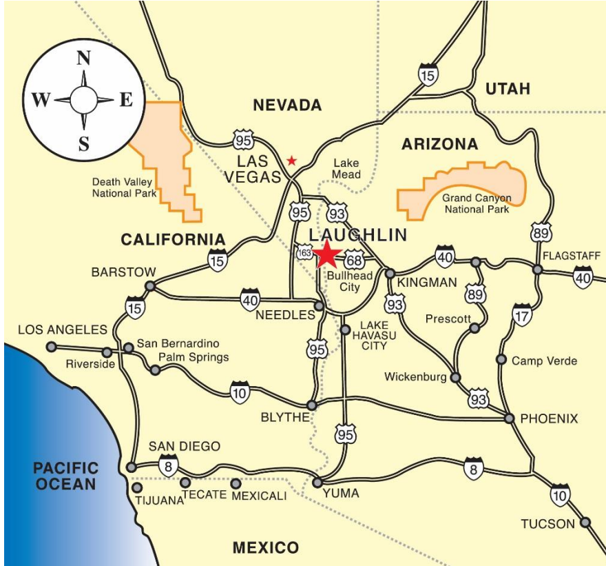
General Laughlin Area Map